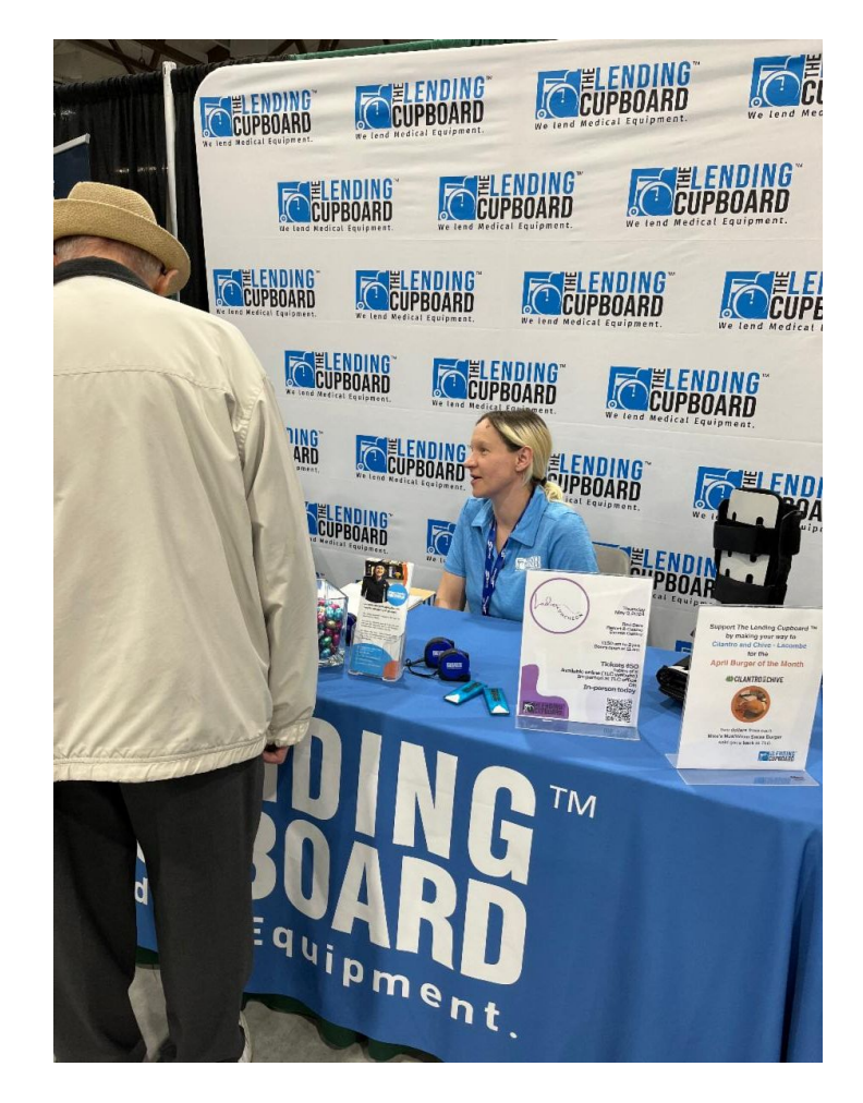
In the Community