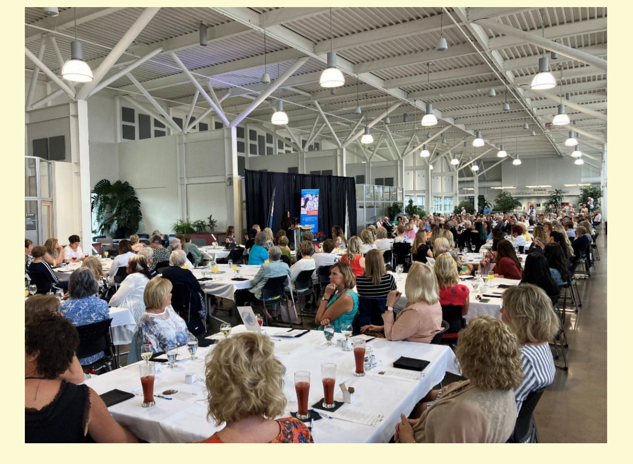
We had a full house for our Ladies' Luncheon on May 11 at RDP!