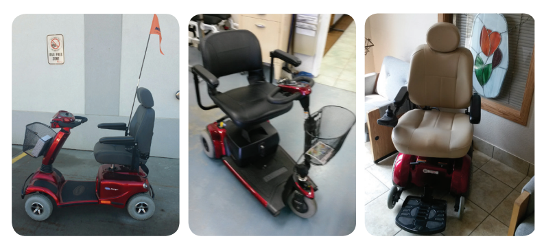
Different styles for different needs and sizes. Speak with a member of our team to learn more!

If you are interested in purchasing such equipment, call us at 403-356-1678 or email contact@lendingcupboard.ca for more information.