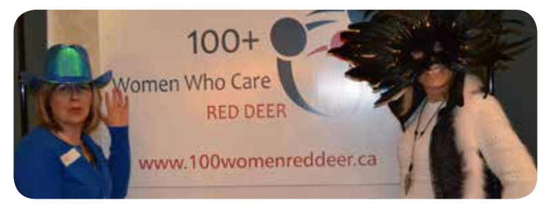
The Gals with 100+ Women We Care Red Deer support community but also have a bit of fun!

We are a registered charity so you can provide a taxable donations of $25 and more. Contact us to discuss how you can become a monthly donor.