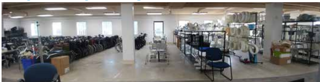
Have you visited us at our new location yet? Drop by, meet our staff and volunteers and check out how our new space looks.