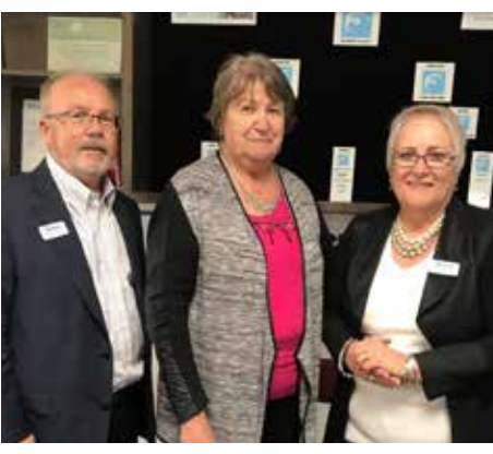
Royal Purple Elks Lodge #193