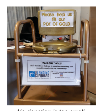
No donation is too small. Together even our Loonies and Toonies grow!

Visit our website at www.lendingcupboard.ca/paying-it-forward to choose the best option that fits you.